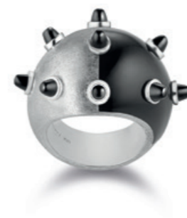
SPUTNIK ECLIPSE Earrings, bangle, pendant and ring with onyx, set in textured 18ct white gold.