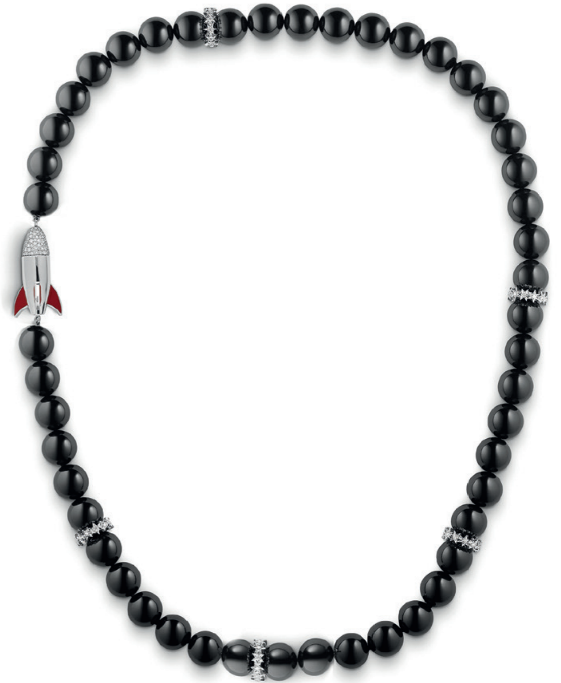
ROCKET Onyx necklace featuring a pavé diamond and enamel rocket clasp, with diamond star detail. Set in 18ct white gold.