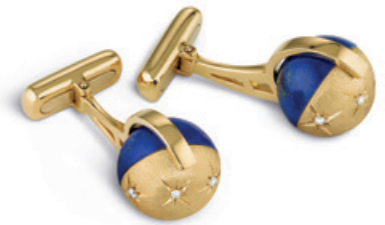
ORBIT Revolving sphere earrings, ring and charm with lapis and diamonds. Pendant with lapis and diamonds, suspended by a chain and pavé diamond bar. Revolving sphere cufflinks with lapis and diamonds. All set in textured 18ct yellow gold.