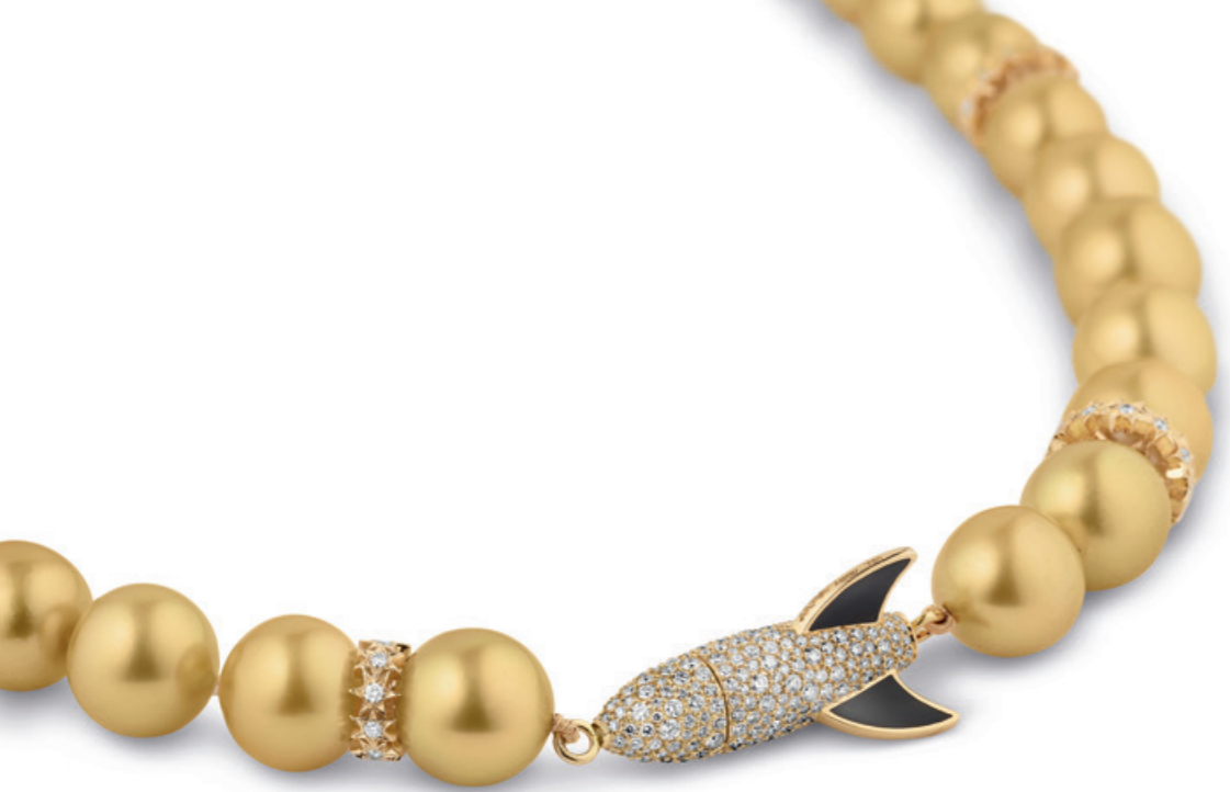
ROCKET Golden pearl necklace featuring a pavé diamond and enamel rocket clasp, with diamond star detail. Set in 18ct yellow gold.